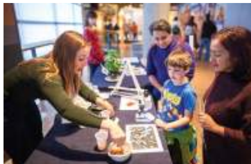
Make the most of special sessions at The Museum of London

The Natural History Museum run Dawnosaurs early mornings for families with children aged 5-11 years on the Autistic Spectrum. Sessions are free but need to be pre-booked and the next ones are on 8th October and 10th December 2016. Visit www.nhm.ac.uk for information.