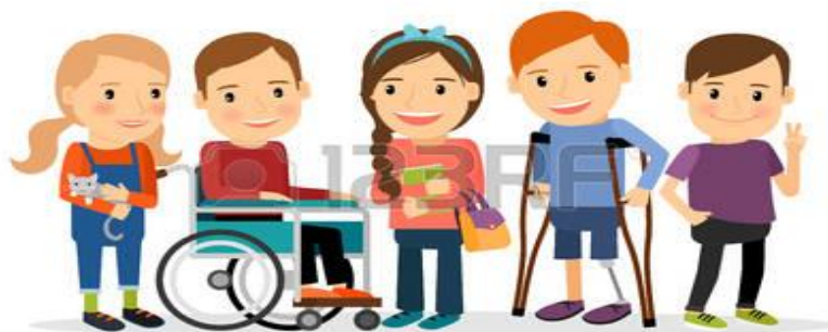
Caring for a disabled children